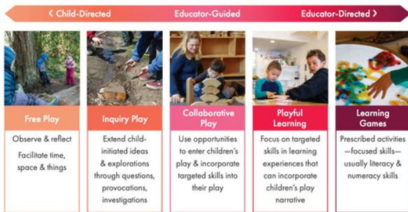
Pedagogical Strategies for Play-Based Learning

Play-based learning can be described along a continuum. The aim of this continuum is to highlight the different forms of play and the wonderful ways they can support a child's development.